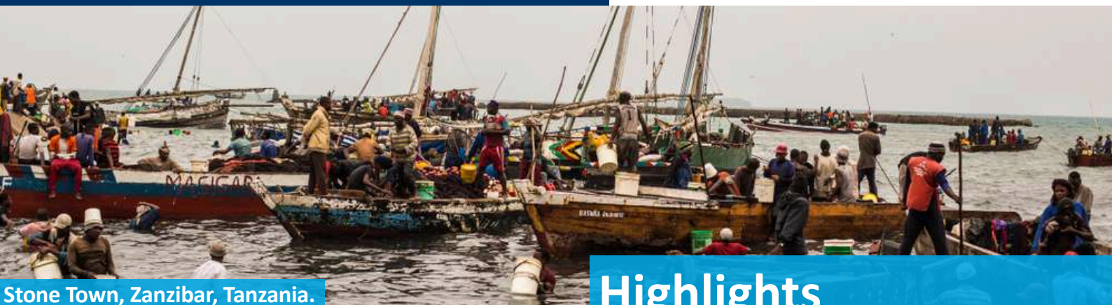
Stone Town, Zanzibar, Tanzania.