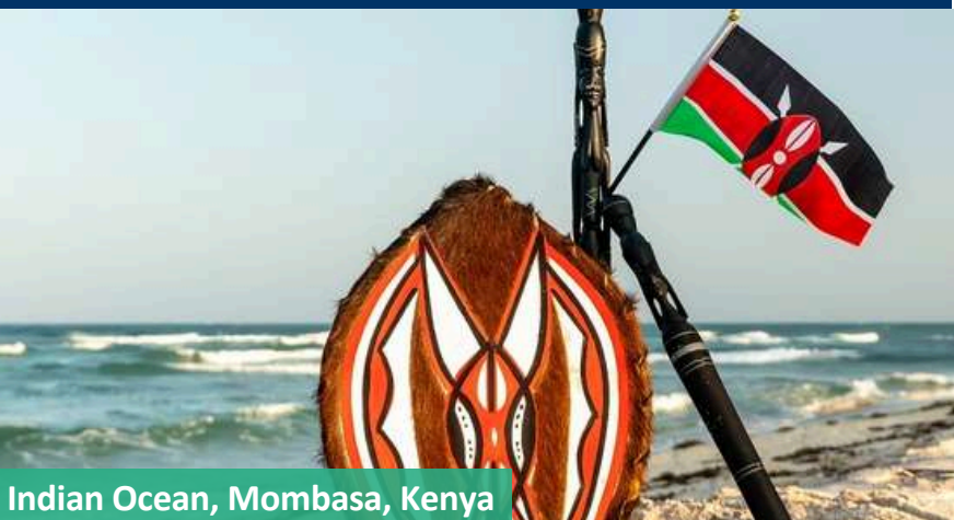
Indian Ocean, Mombasa, Kenya